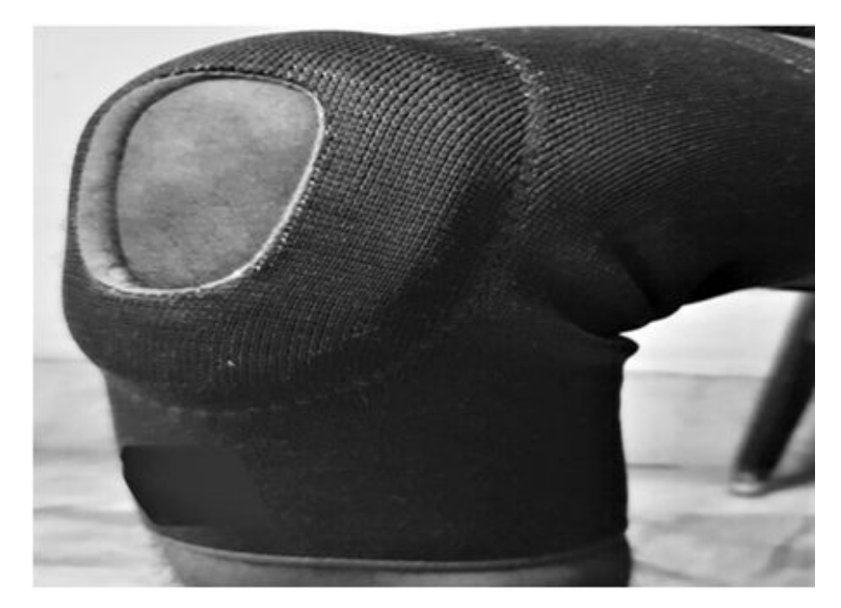
Fig 4: Open Patellar Knee Orthosis