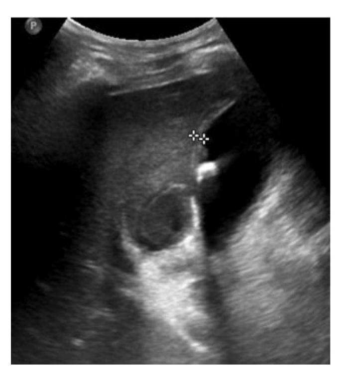
Figure1a: Ultrasound image showing gallbladder with thickened wall measuring approx. 3-4mm and a calculus of size 7-8mm.