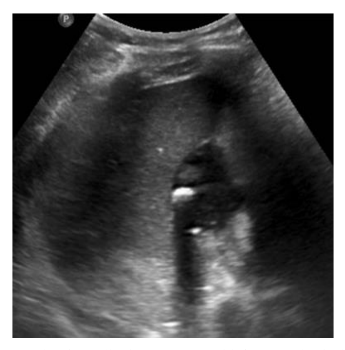
Figure 1b: Ultrasound image showing collection (15-20cc) with few extra luminal calculi (largest calculus measuring 8-9mm adjacent to gall bladder.