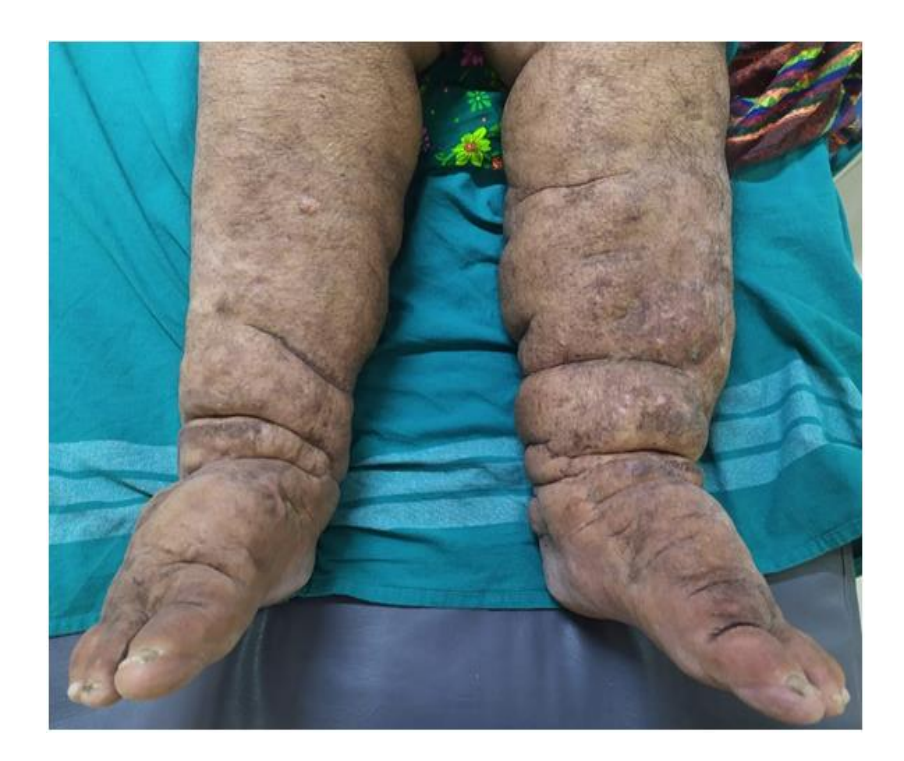
Figure 2: this picture depicts bilateral leg edema, which is the classic feature of hereditary lymph edema

Figure 1: Patient's Family Tree is Consistent with Autosomal Dominant Inheritance of Hereditary Lymphedema.