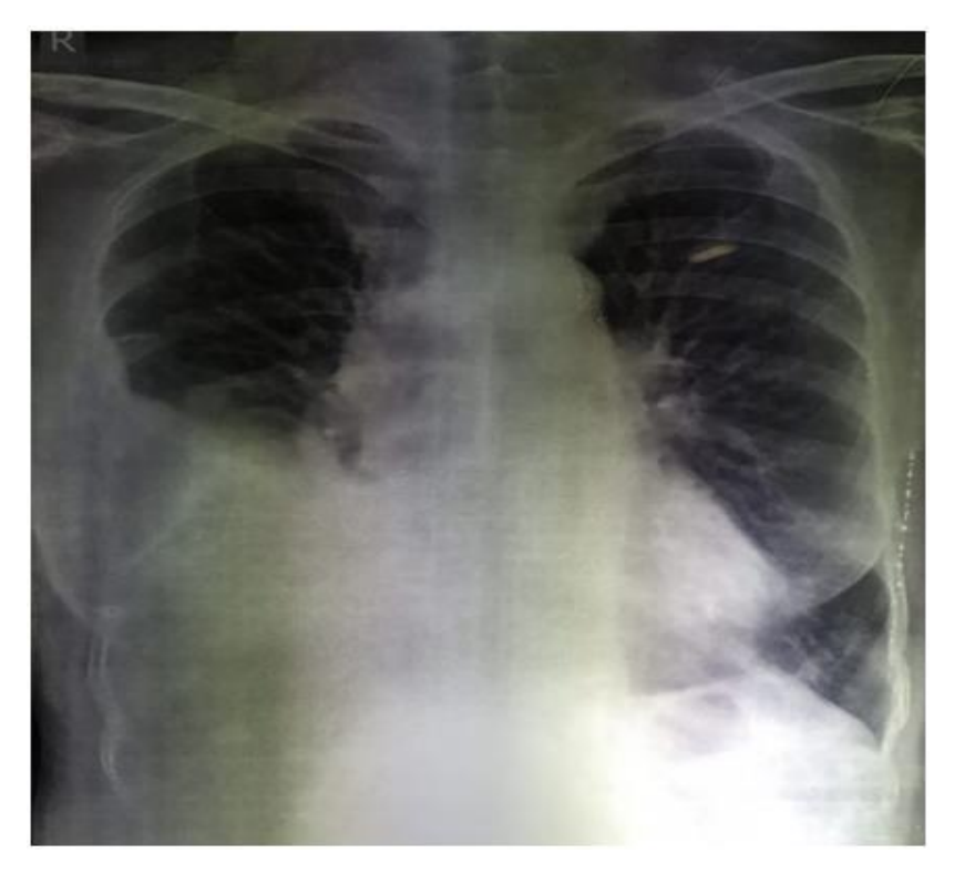
Figure 3: Chest Roentgenography of the Patient Demonstrating the Right Moderate Pleural Effusion